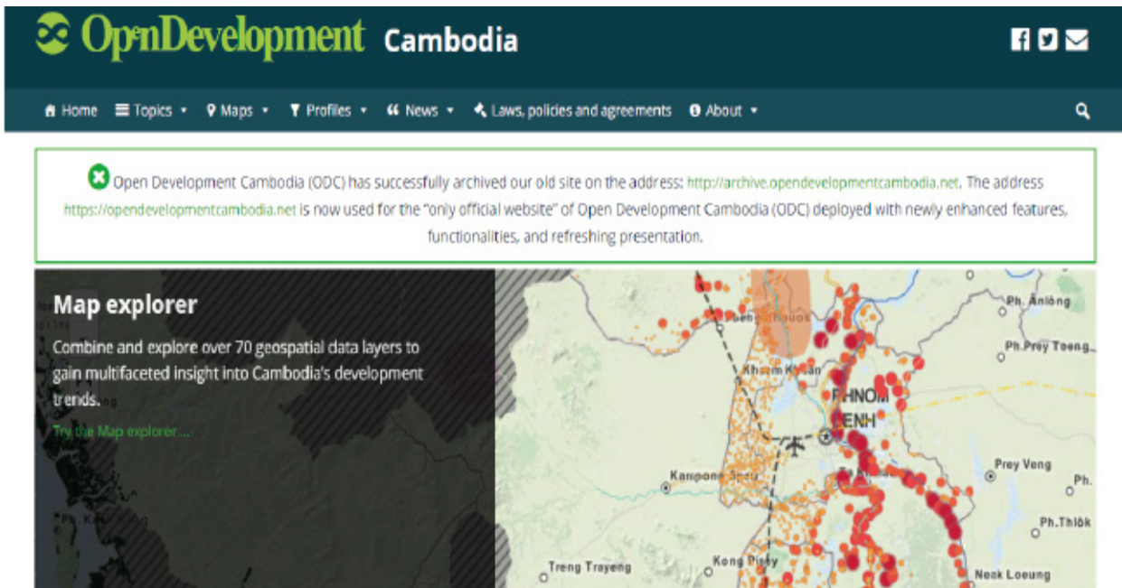
Figure 1. ODC’s Open Data Portal

the information on topics like the quality of Cambodian governance, environmental policy and construction codes would not be possible without government data being made accessible.