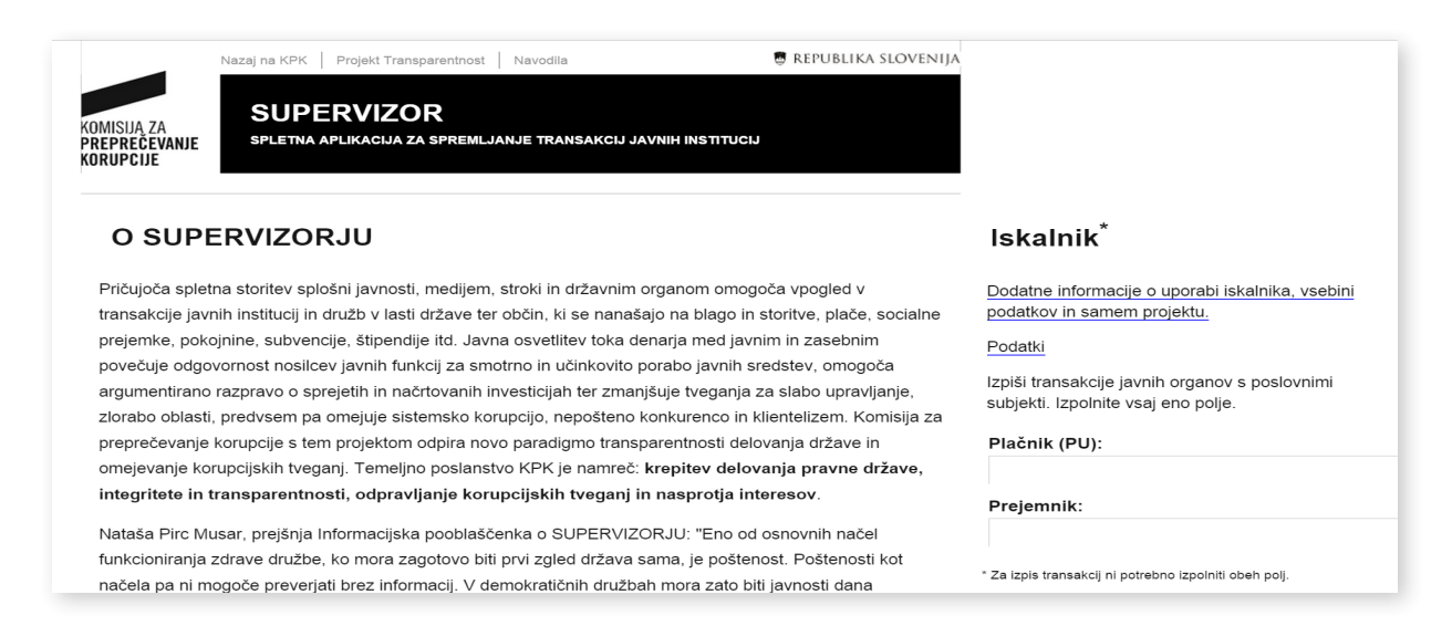
Figure 3: Supervizor main page

The outcome of this legislation was a portal called Supervizor, which provides information on the business transactions of public sector bodies, including legislative, judicial and executive entities; community-level agencies; public institutes and more. The project was developed by the Commission for the Prevention of Corruption of the Republic of Slovenia and partners in the Slovenian Ministry of Finance, the Public Payments Administration of the Republic of Slovenia and the Agency of the Republic of Slovenia for Public Legal Records and Related Services. The portal at present contains data going back to 2003 (just prior to Slovenia's joining the EU) and indicates various types of information, including that on contracting parties and larger recipients of funds. Data is available in graph or printout form for specified time periods. Its content has been described by one reporter as "a breath of fresh air."