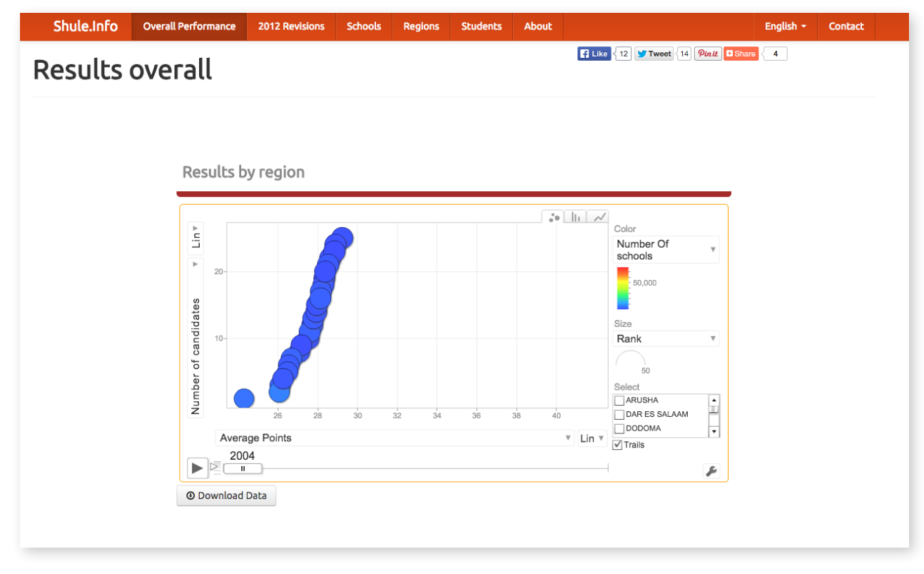
Figure 2: Education results by region on Shule.info

Minde states that his aim in developing Shule was to make information available to everyone with a potential interest in it: parents choosing schools for their children; students looking up examination results; policymakers seeking to track educational trends and progress; and journalists wanting to improve their educational coverage. The original pilot of the site was ready in three weeks, but was revised and improved after Twaweza, a Tanzanian civil society organization promoting effective and transparent governance, became interested in Minde's project. Twaweza's advice prompted Minde to modify the design of his site for increased appeal and usability, and to double the number of indicators.<sup>21</sup>